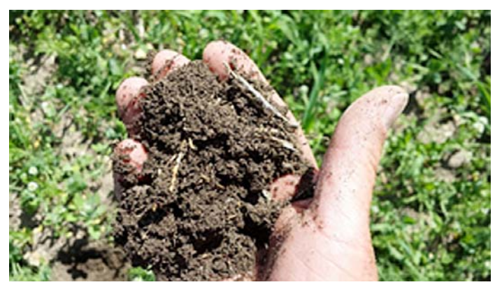
Figure 2. Aggregation, root mass needing improvement.