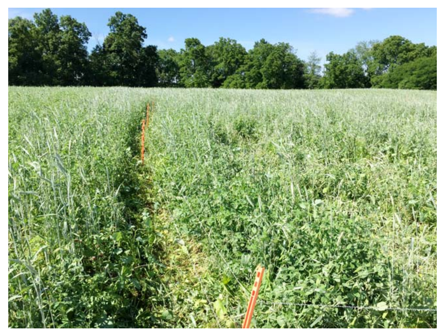
A diverse pasture mix of rye, peas, and brassicas builds healthy soil and provides high-quality forage.

And when you add a well-managed grazing plan to the system, you get the benefit of animal impact that contributes organic matter and biology to the soil system. Increases in soil aggregation, organic matter, and diversity buffer soil temperatures, preserve water, and minimize soil compaction. In short, the functionality of your soil improves.