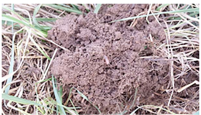
Figure 1. Excellent aggregation.