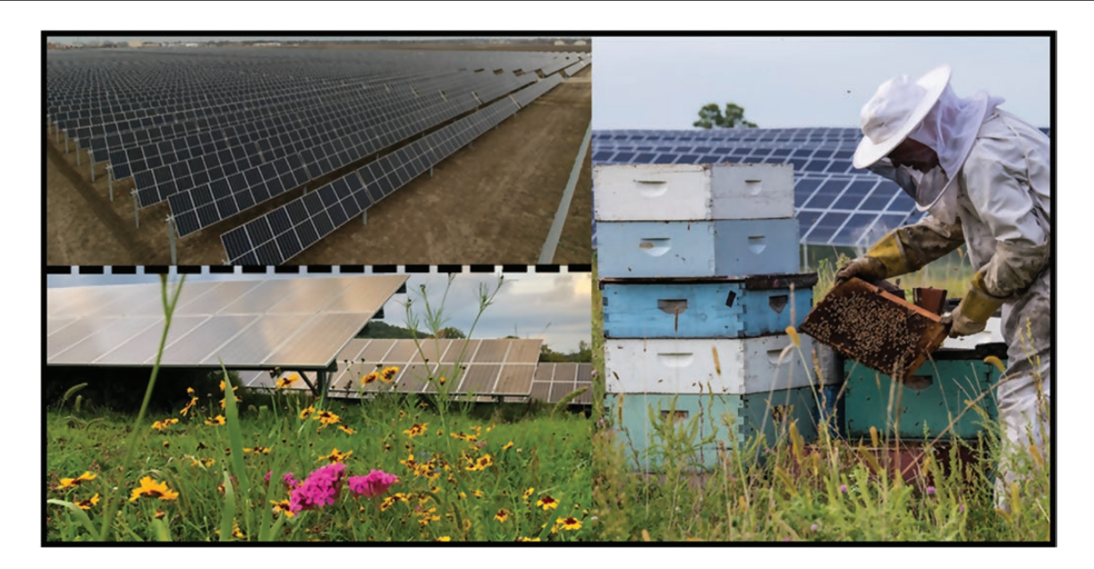
Fig. 1. Top left: a conventional solar farm with gravel substrate (Anon 2020). Bottom: mature pollinator-friendly solar farm. Top: solar farm with a honey bee apiary.

2019). Expanding the definition of agrivoltiacs to include beekeeping would add a form of agriculture that produces a product (honey) that reveals the quantifiable benefits of the flowering plants. While some small solar establishments may not provide sufficient flowering resources to significantly affect honey production, others are seeing implementation at a very large scale. For example, the Aurora Solar farm in Minnesota spans over 1000 acres (Swinterton Renewable Energy 2021), and 15 developments of at least this size are currently planned or in progress in Indiana (Weaver 2021). In addition to increased honey production, diverse sources of pollen have been shown to improve the response of honey bees to pathogens (DiPasquale et al. 2013, Dolezal et al. 2019), and could help reduce colony losses and thus improve profitability and sustainability.