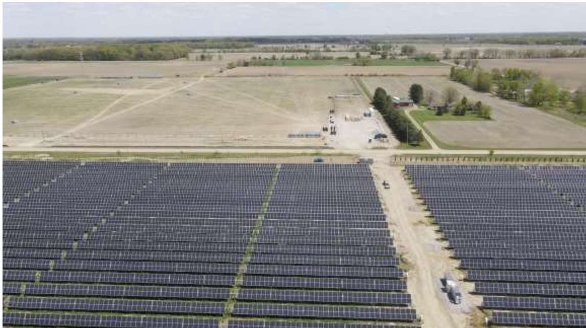
Figure 7: Assembly Solar, PA 116 parcel.

Moreover, agricultural land is often located near substations and transmission lines. Transmission lines take electricity from the power plant to where it is consumed. Many interviewees cited a rule of thumb that every additional mile required to reach a substation or tap into a transmission line adds $1 million to the project cost. Therefore, siting solar power near existing transmission lines is crucial.