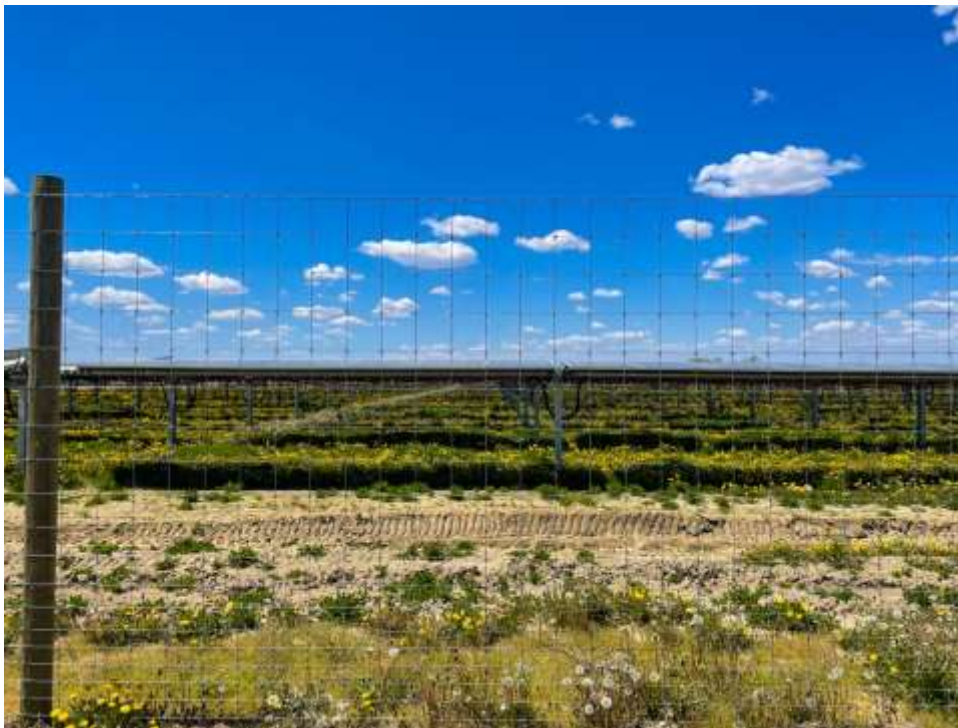
Figure 4: Assembly Solar, fencing, dandelions, May 14, 2021.

In addition to payments, another means of reducing literal aesthetic impacts is to select visually appealing fencing. A “green fence” consisting of trees, hedges, and shrubs can obscure the view of the solar facility for neighboring households and also provide resources for pollinators. Best practices indicate barbed wire fences and chain link fences should not be used. Rather, a livestock fence (Figure 4) that better fits the community aesthetic of an agricultural place, or other decorative fencing, should be used, even though it increases the cost. (Note that fencing is required to adhere to North American Electric Reliability Corporation standards.)