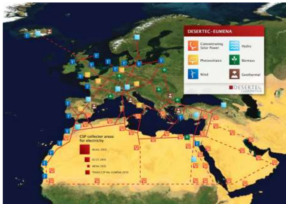
Figure 3: Desertec Foundation illustration of the amount of land needed for concentrating solar power plants to power world and regional energy demand.

Overall, people respond to survey questions with a hypothetical conception of renewable energy, which can shift when a concrete project is proposed on a landscape that they value. Social science studies on renewable energy siting conflicts consistently find that proposed solar sites are not just areas of vacant land but are places valued by nearby communities for reasons that are both tangible—loss of the use of the land, reduction in property values, fears about safety—and intangible because they are related to peoples’ identities and values (e.g., Devine-Wright, 2011; Moore & Hackett, 2016). The factors that cause people to value a parcel of land do not necessarily objectively exist within the land, but exist vis-à-vis the perceptions, memories, ideas and feelings of community members. Barren, flat farmland in the eyes of one person is an important landscape with history and value to another person, who may therefore resist change to that landscape. This subjective valuation of places is the overarching reason that most commonly underpins community opposition to renewable energy.