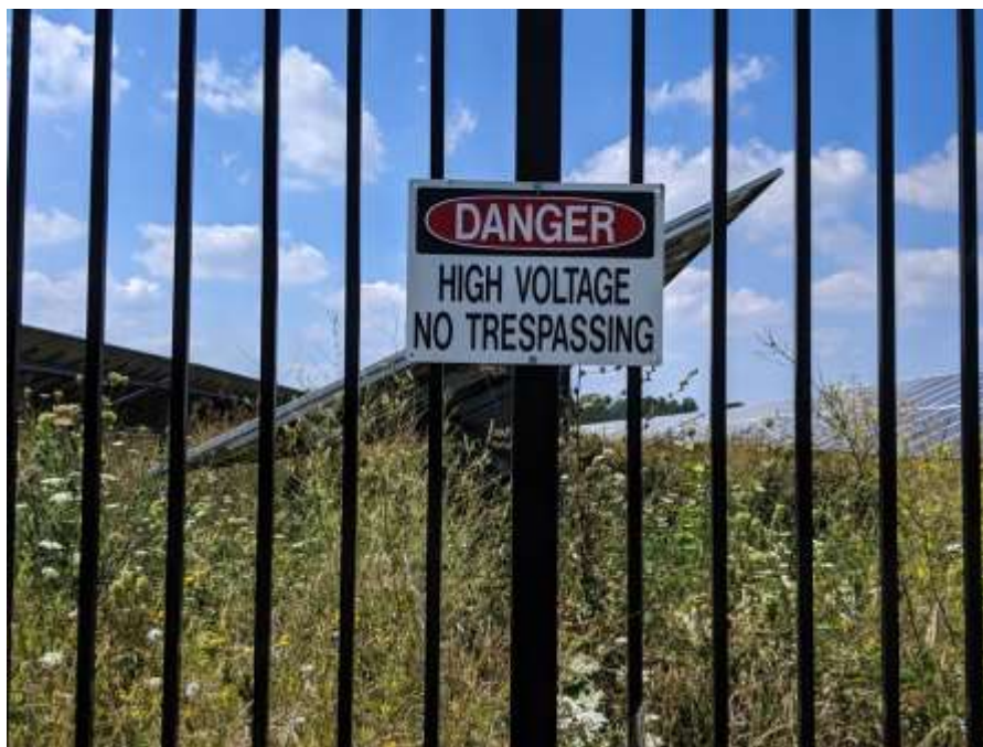
Figure 16: O'Shea solar project in Detroit, August 2019, appears messy but is pollinator habitat.

As previously addressed, the governor's workgroup on PA 116 assumed that pollinator plantings on PA 116 land utilized for solar development would increase public acceptance of solar power. They assumed communities oppose literally seeing renewable energy and that pollinator habitat will improve the aesthetic appeal of solar power and thus increase public acceptance. Assumptions about increasing public acceptance because of visual impacts are just that: assumptions. These assumptions require validation. Furthermore, stakeholders should bear in mind our previous discussion explaining why aesthetic opposition to renewable energy is not simply about literally seeing renewable energy on the landscape. While it was not within the scope of this study to fully explore whether pollinator habitat increases public acceptance of utility-scale renewable energy, preliminary results are mixed. There is a risk of public misperception about pollinator habitat if it is not carefully approached and combined with education.