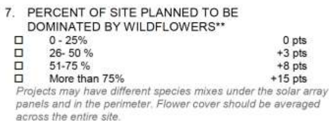
Figure 10: MSU scorecard, percentage of site dominated by wildflowers

Similarly, expert interviewee 9 stated, “Some food resources are better than no food resources. So I think that’s obvious.” Ag interviewee 4 emphasized that quality should be prioritized over quantity: “One of the