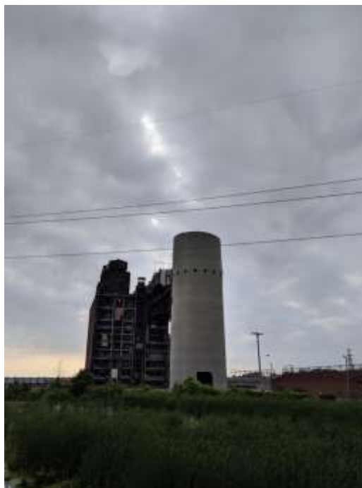
Figure 1: BC Cobb coal-fired power plant in Muskegon, Michigan, being dismantled, summer 2019.

Two other factors drive the urgency of energy transitions. First, transportation has recently surpassed electricity as the largest source of greenhouse gas emissions in the United States (U.S. Environmental Protection Agency, 2019). These emissions mainly come from burning gasoline and diesel in cars and trucks. A transition to electric vehicles offers a technologically feasible alternative, but renewable electricity generation will need to be increased to maximize the climate change benefits of electric vehicles. In Michigan, GM has already committed to a goal of producing only electric vehicles by 2035 (Boudette & Davenport, 2021). Second, though still preferable to coal, electricity generation from the rapidly growing natural gas industry has its share of climate change drawbacks. While natural gas is theoretically assumed to emit one-third of the carbon dioxide emissions of coal because of its greater energy density, methane leaks from natural gas storage facilities, pipeline and distribution infrastructure, and extractive operations reduce this number in practice (McKain et al., 2015; Oyewunmi, 2021). Methane is 20 times more powerful on a per molecule basis as a greenhouse gas than carbon dioxide (Dessler, 2016).