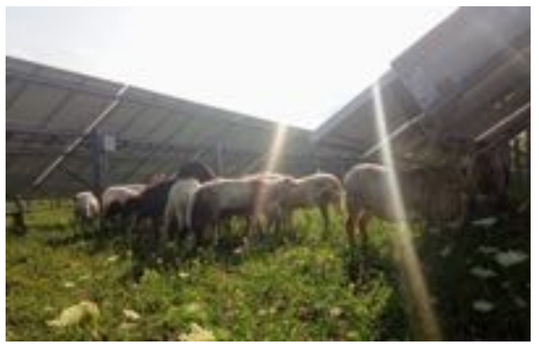
Lexie Hain, Agrivoltaic Solutions LLC

One of the biggest lessons learned is that grazing dual-use solar should be planned in advance if it is to be successful. Developers and farmers should consider how sheep will get to the site, how they will have access to water, what to do if/when they run out of forage, and how to address lambing. These considerations are often set out in a prescribed grazing plan or in the contract between the farmer and the solar developer. Unfortunately, many solar developers do not plan ahead for grazing, and this lack of planning can hamper the effectiveness of these projects for dual-use. For example, when a project is built, the solar developer might not plan for water to be on the site or not build the fence deep enough to keep out predators that can dig under traditional fencing.<sup>117</sup> Developers should also consider grazing when they are making their contracts with the land owner in order to tailor the language to the grazing use. Finally, contracts will need to consider liability issues and safety requirements that meet local and federal standards and are within reach of the average grazer.<sup>118</sup>