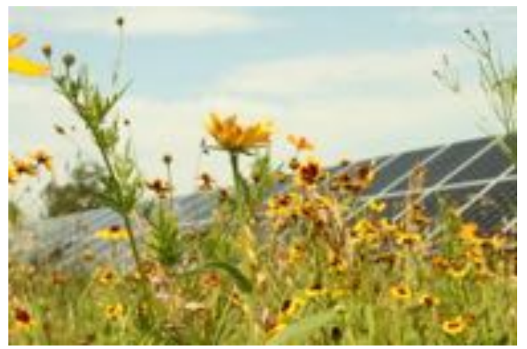
Engie Distributed Solar

Third, establishing solar development best practices for dual-use solar projects (from pollinatorfriendly to agrivoltaics) could facilitate siting and permitting projects. Additionally, permitting