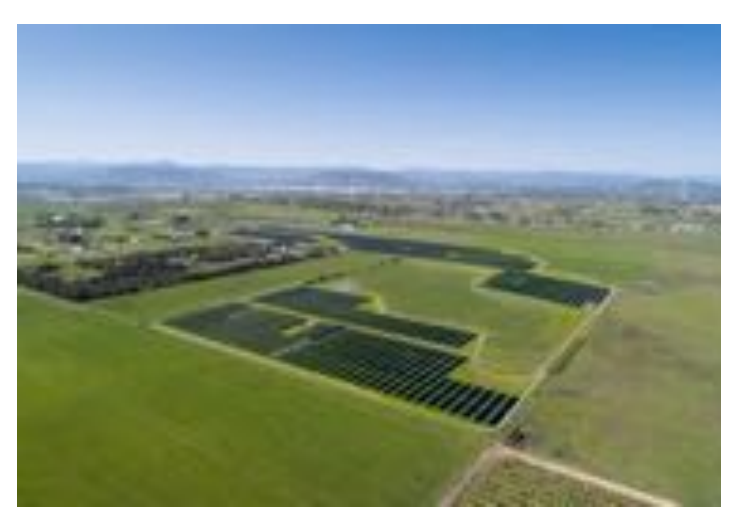
Pine Gate Renewables

restricts development unrelated to farming. However, there are a lot of uses allowed on farmland under certain acreage limits that are subject to county review including mining, oil and gas extraction, and energy generation from wind and solar.<sup>34</sup> If a developer wants to build a solar site larger than Goal 3 rules allow, they must get a formal exception to Goal 3. But the exception process is general and not tailored to solar; moreover, this