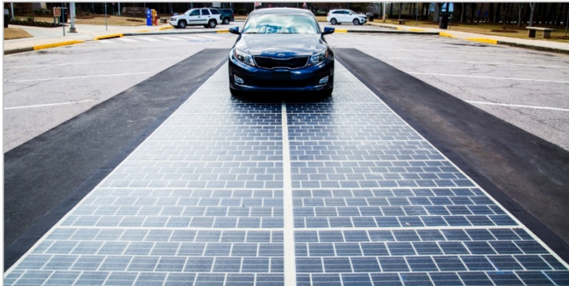
Figure 2: The Wattway drivable solar road surface at the I-85 Visitor Information Center along The Ray

autonomously change colors in real-time to reflect information about the roadway, such as black ice, heavy fog, or accidents ahead.