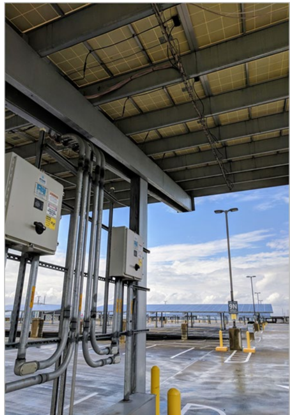
Figure 5: Solar canopies at BWI Airport in Baltimore, MD (Source: Volpe Center).

MDOT overcame several challenges when implementing this project. Because the solar panels were placed on a parking deck with internal post-tension cables, special