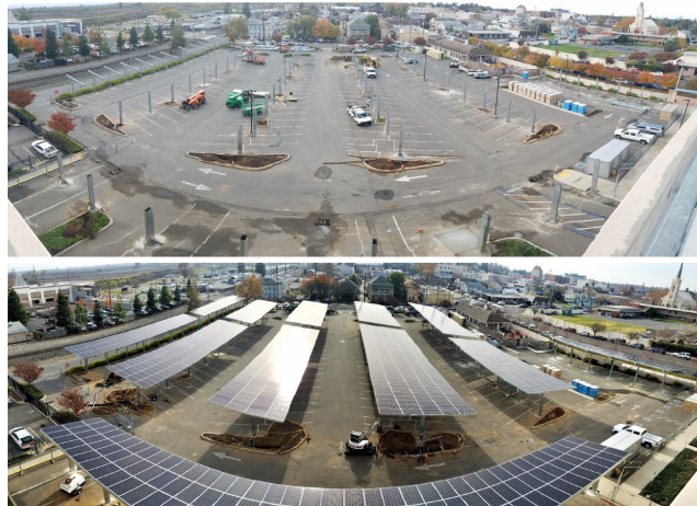
Figure 3: Installation of a solar canopy at a Caltrans parking lot.

In terms of ROW solar, in 2011 Caltrans did a study on linear parcels and third party agreements.