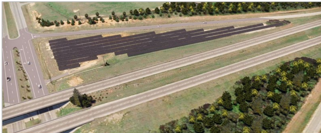
Figure 1: Computer rendering of planned 1 megawatt solar array to be located at Interstate 85 Exit 14 in Georgia

The proposed solar array will benefit the highway system by providing rampway lighting for all four corners of rural Exit 14 for the first time. The Ray would like to design the project as a pollinator-friendly pilot project, which will involve planting seed mixes that attract pollinators around the panels, rather than planting the typical turfgrass understory or covering the area with gravel.