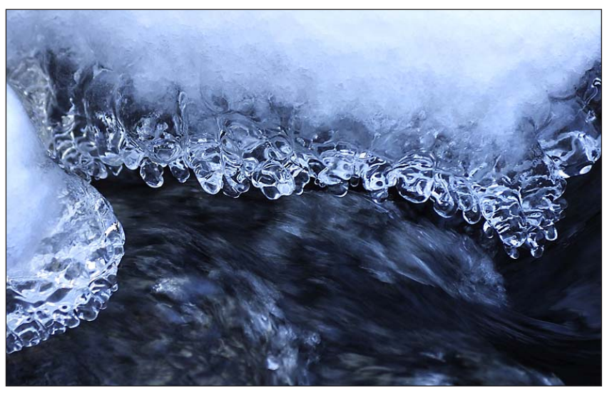
When installing the system, you'll need to reduce the chances of freeze-up of components that may be in contact with water.

You have several options to prevent freezing, including using heat from the earth or sun, insulating components, and continuously circulating water. By following a few basic design principles