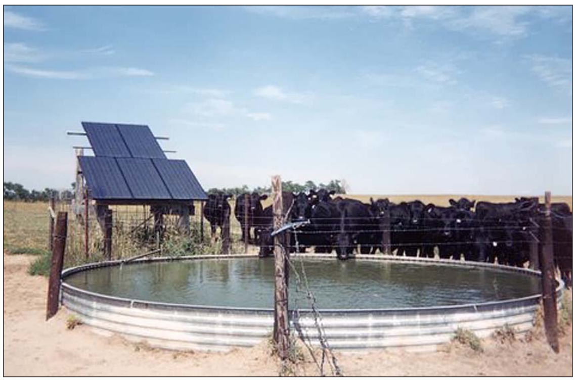
Solar-powered livestock watering system.

Because of falling prices, long life, and low maintenance requirements, solar is rapidly becoming the first choice for pumping water in remote locations. This publication gives an introduction to solar-powered livestock-watering systems, including discussions of cost, components, and terminology, as well as some suggestions for designing and installing these systems. The strengths and weaknesses of solar pumping are compared to the main options for pumping in remote locations: mechanical windmills, wind turbines, and portable generators powered by gas, propane, or diesel fuel. Design considerations for freeze protection in water-pumping systems are also discussed. Descriptions of four successful projects and a brief resource list are included.