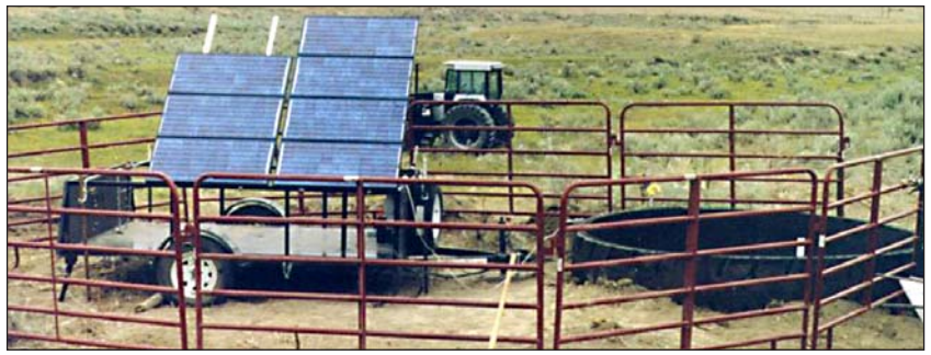
A trailer-mounted PV system is improving range management and water quality along Painted Robe Creek near Lavina, Montana.

to water 150 cattle at the site of a 60-footdeep well. Seven 60-watt panels on a fixed, trailer-mounted rack use an inverter to convert solar-produced DC to the AC electricity needed by the submersible centrifugal pump. Water is pumped into two 1,100-gallon tanks. The system is designed to produce average flows of 2,880 to 4,000 gallons per day during the summer months. Solar component costs in 2001 were $10,650.