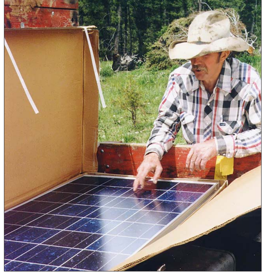
A dealer can help you size and design a system that will meet your specific needs.

Storage. Batteries are usually not recommended for solar-powered livestock watering systems because