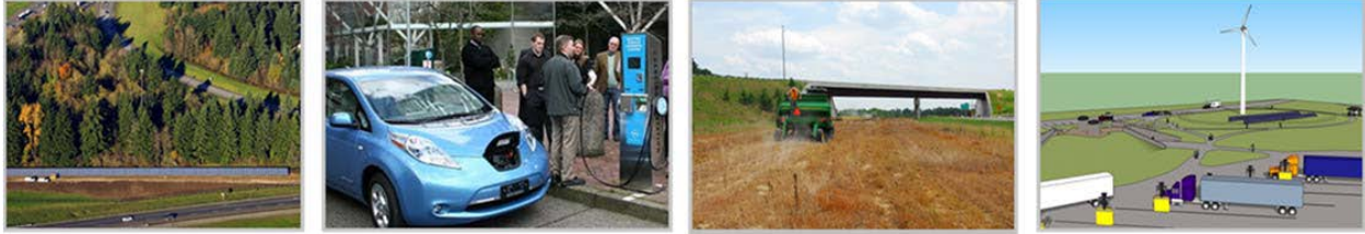
Sources (left to right): Oregon DOT, U.S. DOT Volpe Center, North Carolina DOT, Ohio DOT