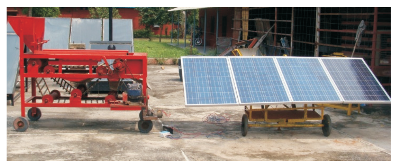
Fig. 1: Solar panels with fruit-cum-vegetable grader

Vegetable-cum-fruit grader: The machine consists of two fixed belt made of canvas (Fig. 1). On these belts plastic pipes are placed at desired spacing. The spacing of upper and lower belts was 4.5 cm and 3 cm respectively. These belts are supported