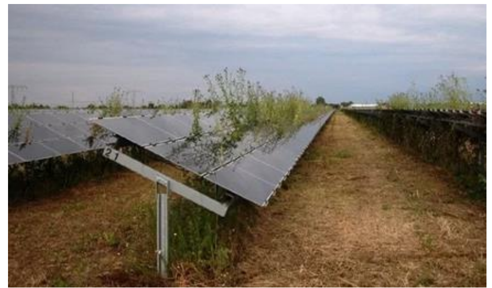
Figure 5. After mowing, prior to string trimming.

Grazing sheep on solar sites is a cost-effective method to control on-site vegetation and prevent panel shading (Figures 5 and 6). At no time in the growing season did vegetation shade the panels. It was less labor-intensive than traditional landscaping services and, thus, less expensive. The grazing trial at the Musgrave solar site was a full success for the site owners and operators, as well as the sheep farmer.