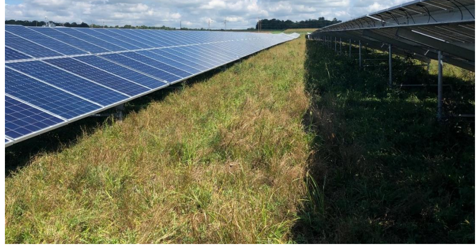
Figure 6. Rotationally grazed with sheep.

invasive species should be explored. An important question for the successful management of solar sites with sheep will be determining what stocking rates and densities should be chosen. Future research is needed to establish sound recommendations.