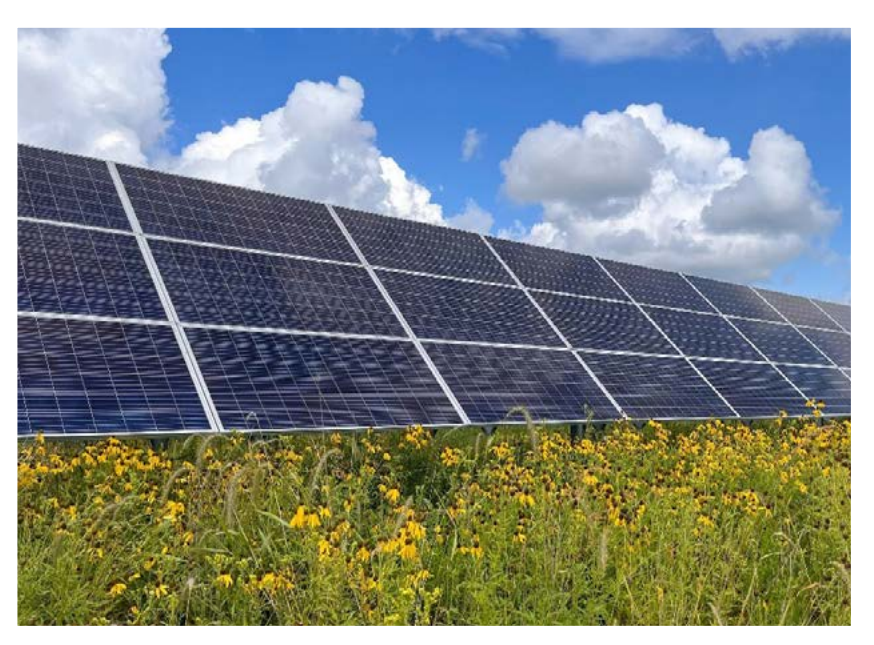
Example image of solar-pollinator habitat at a solar site in Minnesota.

Many climate scientists, energy planners, and governments agree that continued deployment of solar energy is needed to achieve our country's <u>grid</u> <u>decarbonization</u> and <u>net zero</u> goals. With these goals in sight, and the decreasing costs of solar energy technologies, it may come as no surprise that solar has recently emerged as the nation's fastest growing source of electricity.<sup>1</sup> And this rapid rate of solar development is expected to continue. For example, approximately 1,000 gigawatts of solar energy – most of which is generated by groundbased photovoltaic (PV) solar plants