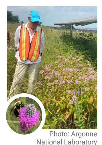
Streamlined Systematic Field Survey Methods for insects. such as the Xerces Society's Streamlined Bee Monitoring Protocol, provide an easy-toadopt and repeatable framework for monitoring insect responses to solarpollinator habitat. These survey protocols could assist in the timely collection of data on