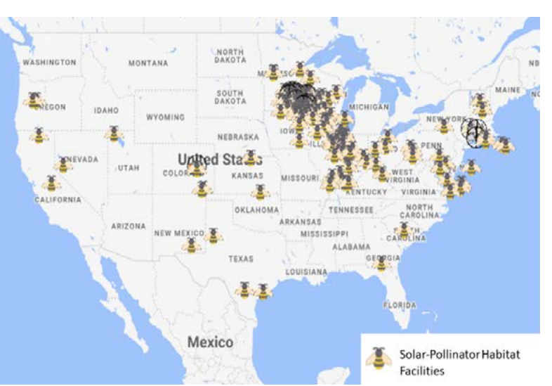
Figure 3. The InSPIRE Agrivoltaics Map, showing the locations of solarpollinator projects in the United States. View the interactive map HERE.

aspects of solar-pollinator habitat is critical to developing best management practices. The challenge, however, is time. Field research will require several years or more to fully understand how vegetation establishes, evaluate vegetation management practices such as mowing or livestock grazing, and understand how certain wildlife taxa respond to this new type of habitat. It is, therefore, imperative that as much research be concurrently conducted as possible over the coming years using consistent methodologies. This will facilitate the rapid science-based decision-making needed to commensurately support the nation's fastevolving renewable energy transition. In addition, this research needs to be conducted across a range of geographies and solar configurations to understand the extent to which solar-pollinator habitat can be ecologically effective – either as a mitigation method to offset impacts of solar development or to provide a net benefit for biodiversity.